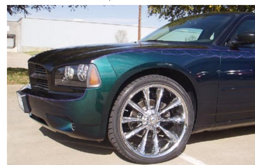
Chrome rims by Chip Foose of Foose® Wheels; Toyo® tires from West Coast Customs

The highlight of the four-day class was the transformation of a stock 2006 Dodge® Charger into a show car with an awesome custom paint job. The car was painted during the class and finished off with custom wheels from Chip Foose, Toyo® tires provided by Ryan Friedlinghaus of West Coast Customs, and window tint provided by Enpro. To achieve the two-tone effect on the vehicle, Jon Kosmoski used the new KPF104SF Fine Aquarius Kameleon® Pearl. As Jon describes, the paint shifts from a