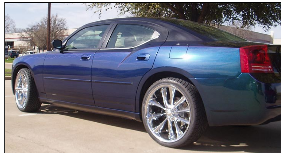
Brand new 2006 Dodge® Charger, made over by House of Kolor®, shines in the sunlight