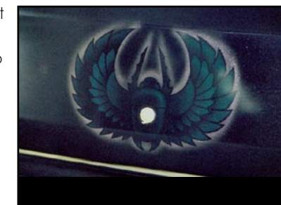
The House of Kolor® scarab, painted by Brian Lynch on the trunk of the car